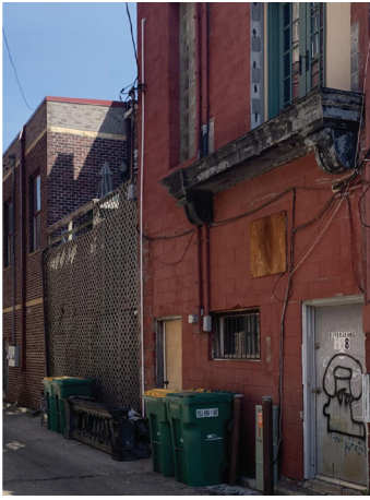
Before and after a mural on Stillwater's Union Art Alley, transformed through a local 2024 Great Idea Grant.