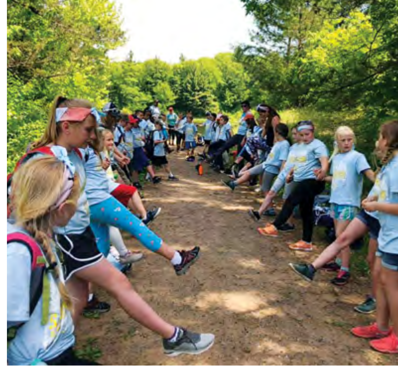
CHILDREN ENJOY YOGA AND COMMUNITY ON FARM TABLE'S PATIO, THE ICE AGE TRAIL, OR THE GARDEN-TO-TABLE AREA