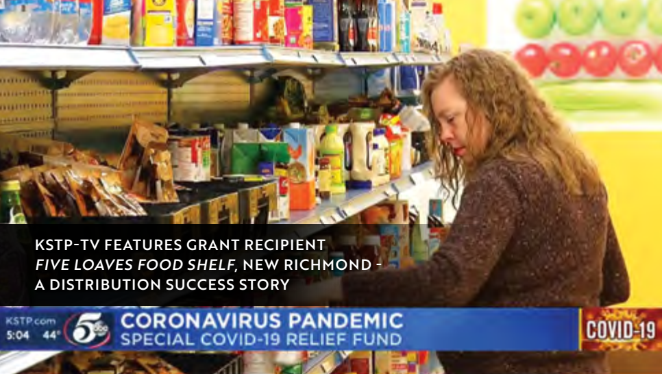
KSTP-TV FEATURES GRANT RECIENT FIVE LOAVES FOOD SHELF, NEW RICHMOND - A DISTRIBUTION SUCCESS STORY