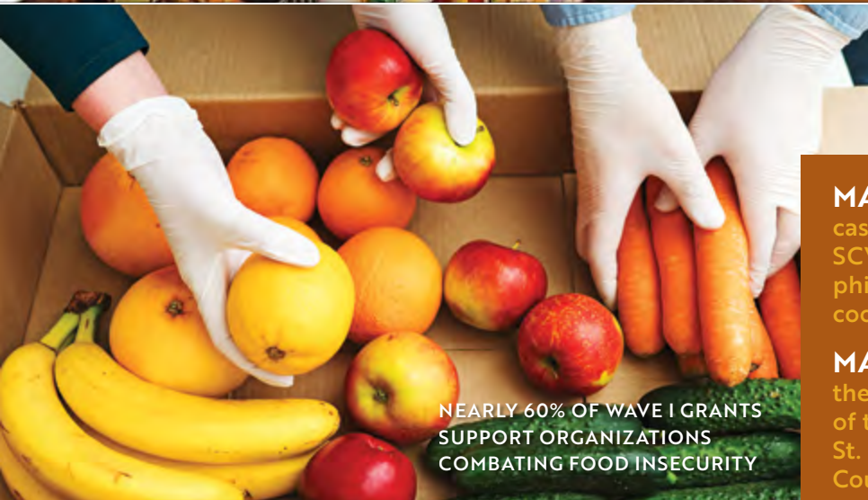
NEARLY 60% OF WAVE I GRANTS SUPPORT ORGANIZATIONS COMBATING FOOD INSECURITY