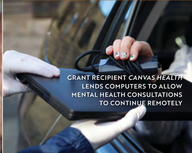
GRANT RECIENT CANVAS HEALTH LENDS COMPUTERS TO ALLOW MENTAL HEALTH CONSULTATIONS TO CONTINUE REMOTELY

MARCH 16 Just weeks after the first U.S. cases of COVID-19 emerged on the West Coast, SCVF leadership convened a meeting with local philanthropic leaders to tee up the idea of a coordinated regional pandemic response. MARCH 23 The COVID-19 Response Fund for the St. Croix Valley was launched — a partnership of the St. Croix Valley Foundation, United Way St. Croix Valley and United Way Washington County East. MARCH 30 First grant distributions announced — nearly $200,000 to 22 nonprofits responding to basic needs for food, shelter, financial assistance and mental health services. By early autumn, over $1 million was raised and granted to 112 area nonprofits.