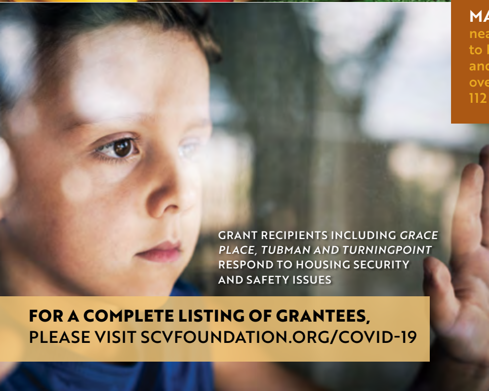
GRANT RECIPIENTS INCLUDING GRACE PLACE, TUBMAN AND TURNINGPOINT RESPOND TO HOUSING SECURITY AND SAFETY ISSUES

FOR A COMPLETE LISTING OF GRANTEES, PLEASE VISIT SCVFOUNDATION.ORG/COVID-19